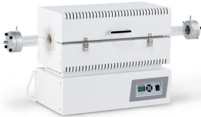
Tube Furnace, Program Control