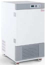
Low Temp. Incubator