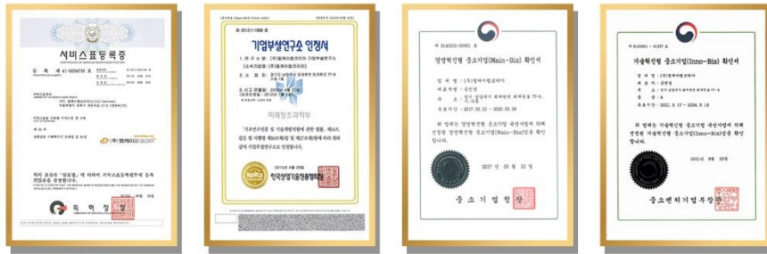
LK lab Korea (Class of 35)