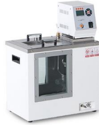
Bath & Circulator