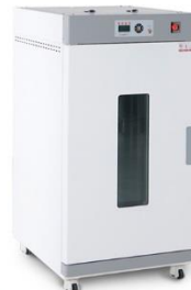
Forced Convection Oven