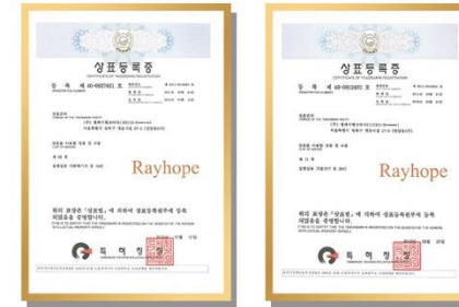
Rayhope (Class of 9)