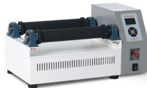
Desktop Ball Mill