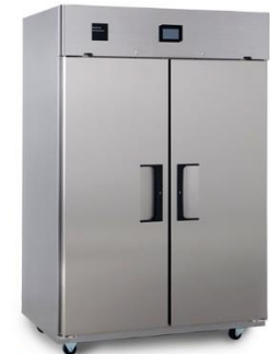
Refrigerator & Freezer