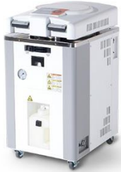
Autoclave, Steam Sterilizer