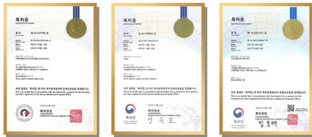
Over temperature alarm system