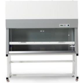
Clean Bench & BSC