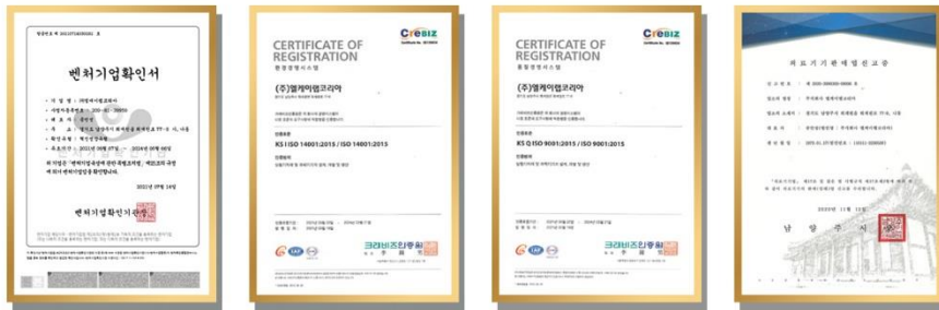
Venture Company Confirmation