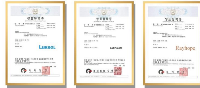
Luke GL (Class of 9)