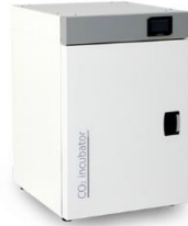
CO 2 Incubator